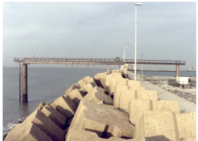
Fig. 2. The Zeebrugge measuring site (rubble mound breakwater).

For the estimation of maximum layer thickness and wave run-up velocity, a theoretical model has been developed on the basis of simplifications of the two-