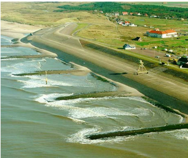
Fig. 1. The Petten measuring site (smooth sea dike).

Two types of coastal structures are investigated: a smooth impermeable sea dike and a conventional rubble mound breakwater.